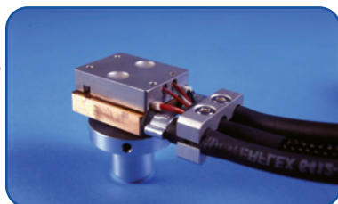
K25X cold stage