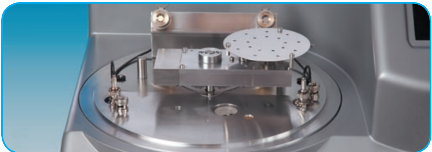
Dual film thickness monitor and swinging arm stage