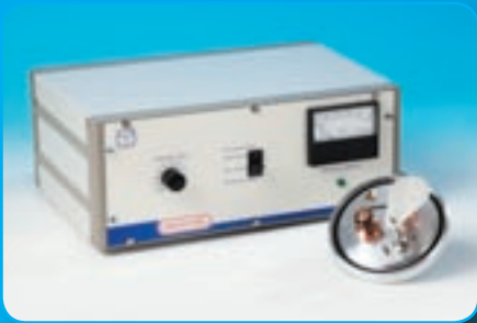
Optional carbon fibre evaporation attachment