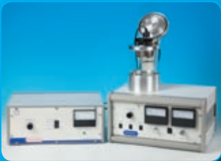
SC7620 and optional carbon evaporation attachment