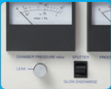
Switch to change between sputtering and glow discharge modes